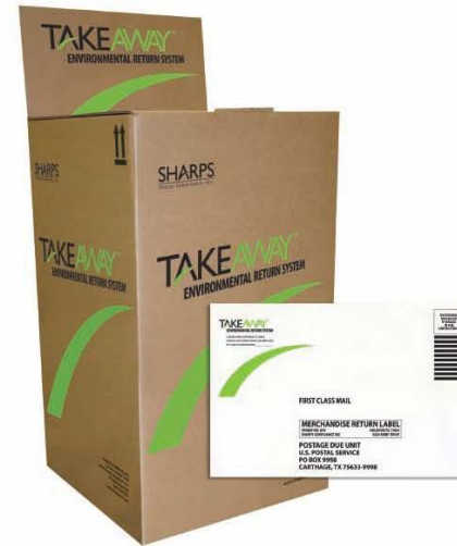
8" x 11" Mailback Envelope, Pharmacy Drop Box

NORTH DAKOTA NDPhA BOARD OF PHARMACY NORTH DAKOTA PHARMACISTS ASSOCIATION